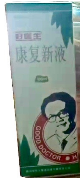
Tsering's bedsores medicine